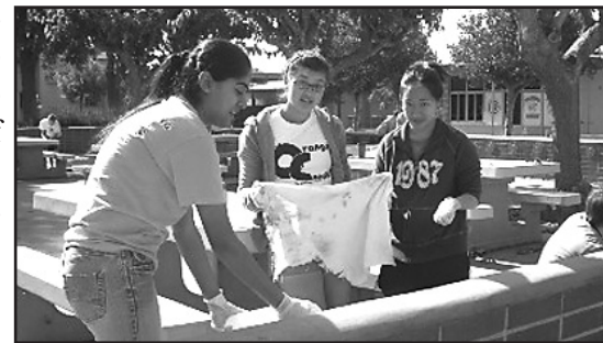
GIRLS HELP OUT DURING TIGER PRIDE DAY.

"I haven't gotten the chance to participate in Tiger Pride Day before," says